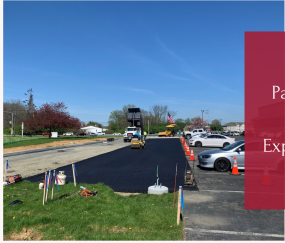
Parking Lot Expansion

We are very excited about the expansion of our parking lot that was completed at the beginning of May! We now have more space for our amazing volunteers to park.