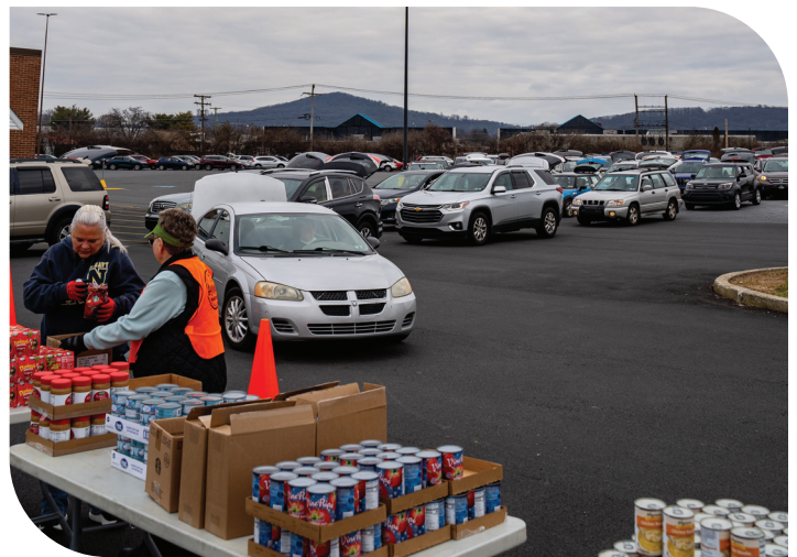
Cars line up for Muhlenberg Mobile Market

However, we are not daunted. We are profoundly grateful for the support from our community: the dedicated network of partner agencies, amazing volunteers, and supporters and friends like you. Together, with your help, we can provide food for our hungry neighbors - the families, children, and seniors in need - now and in the times ahead. On behalf of those we serve, thank you for joining in the fight against hunger.