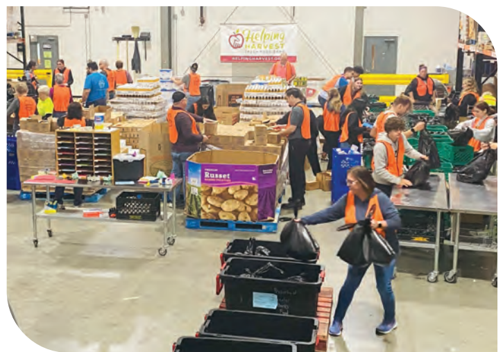
Volunteers pack the weekly bags

However, as the children returned to school for the 2021-22 school year, our Programs Department worked diligently to make the program stronger than ever. These determined efforts have continued into the current school year. Today, Helping Harvest distributes Weekender bags at 70 school sites (primarily elementary schools) in Berks and Schuylkill counties.